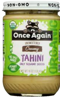
Once Again Organic Tahini

Spreading integrity since 1976, Once Again is a 100% employee-owned company that produces clean ingredient nut & seed butters and snacks. Our passionate employee owners take pride in fueling healthy lifestyles with small-batch, high-quality products crafted as close to homemade as possible.