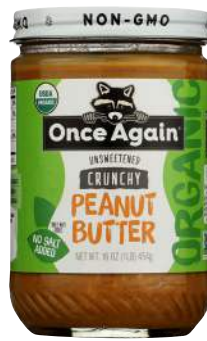
Once Again Organic Peanut Butter