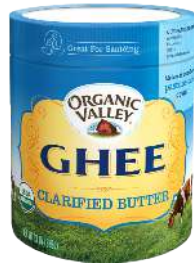
Organic Valley Organic Ghee