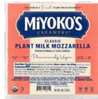
Miyoko's Organic Vegan Mozzarella