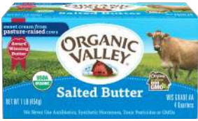
Organic Valley Organic Butter