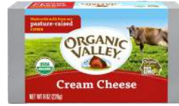
Organic Valley Organic Cream Cheese