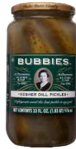
Bubbies Kosher Dill Pickles